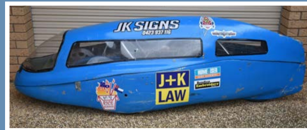
Human powered vehicle courtesy of Weeroona College Bendigo