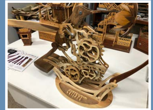
Newton William's 'Colibri #2'